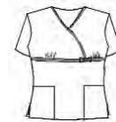
Bow Wrap 948 COU XS-XXL Harbor Blue Trim

Coordinates best with: Harbor Blue, Ginger Spice, Navy, Olive, Mocha Bisque