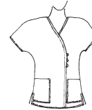
Moc Wrap Top 941 SSF XS-XXL Ginger Spice Trim

Coordinates best with: Ginger Spice, Olive, White, Black, Mocha Bisque